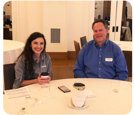
Photos on the left are from the 2019 DTE designated trade ally golf outing.